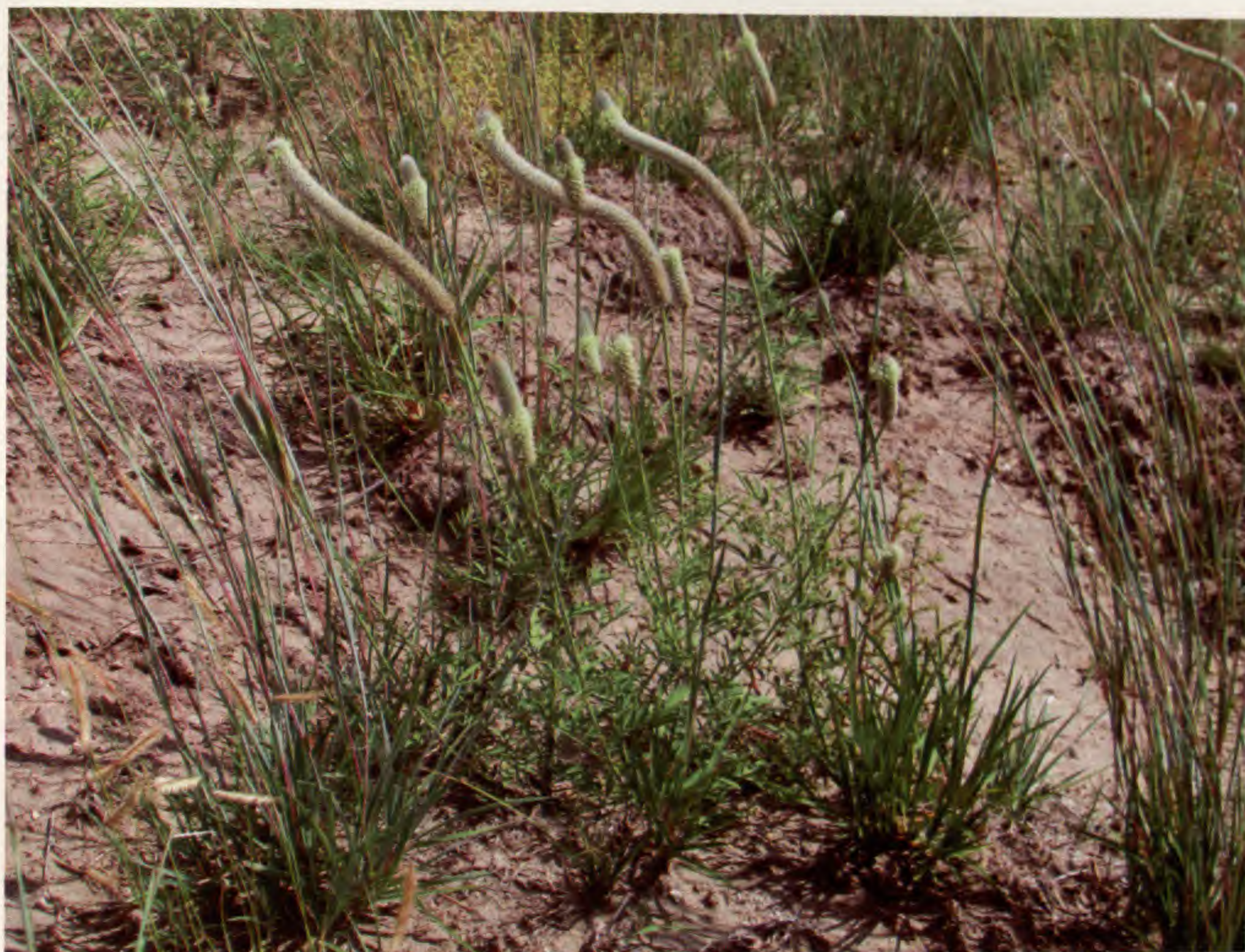
FIG. 2. Dalea cylindriceps , Sheridan County, Nebraska.